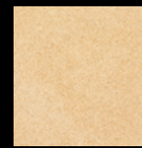
Sedona DS II