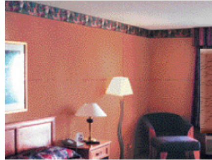
Grand Casino, Biloxi, MS

Premium Plexture finishes such as Symphony and Sedona DS II will typically install for $0.95-1.05 per square foot under the same project conditions. Regardless of the finish selected, Plexture is warranted against mold and mildew growth (ASTM D 3273) and coating integrity for five (5) years. Eighty-six standard colors plus custom color and texture options provide a very wide range of design options.