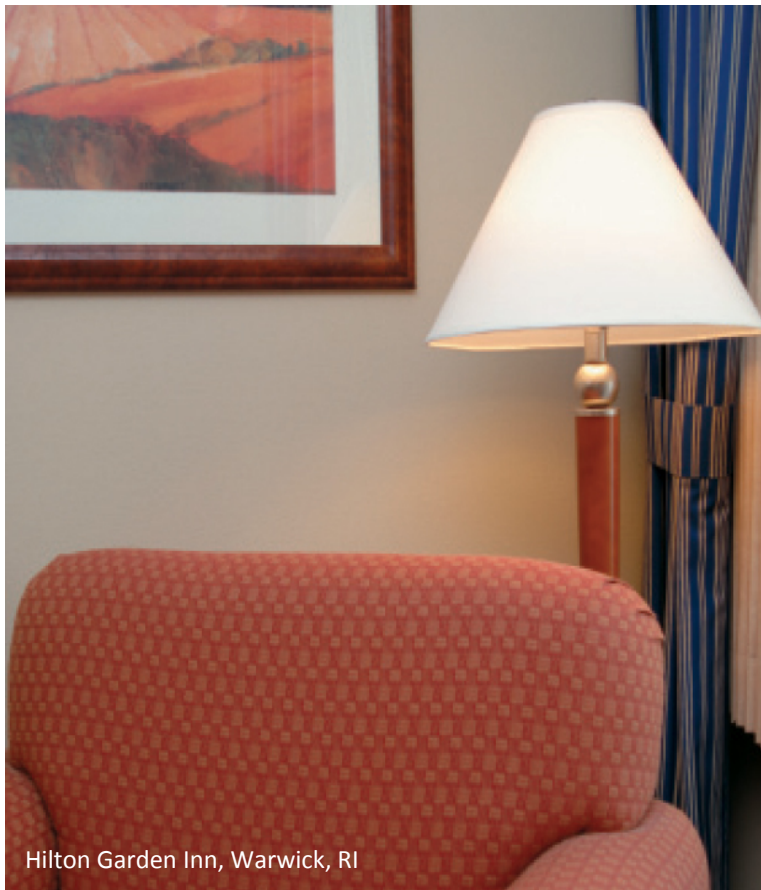
Hilton Garden Inn, Warwick, RI